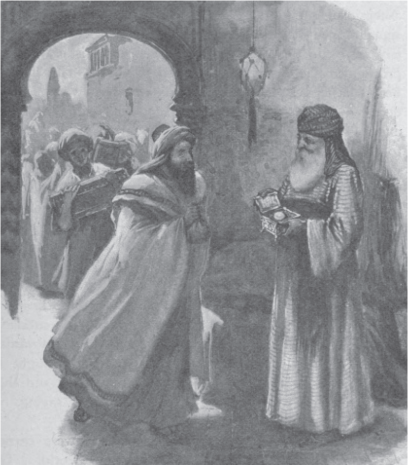
"A merchant seeking fine pearls."

The unexplained element in this parable is the “pearl of great value,” which is the object that the man purchased or redeemed at the greatest cost. Since the previous parable focused on the redemption of Israel, it seems likely that this parable completed the picture by focusing on the redemption of Gentiles using the metaphor of a pearl. This is a reasonable deduction, but because Jesus did not explain the parable for us, we certainly cannot be dogmatic about this conclusion. Earlier in the Gospels, Jesus did give several hints concerning the salvation of Gentiles (Matt 12:15-21,38-42; Luke 2:30-