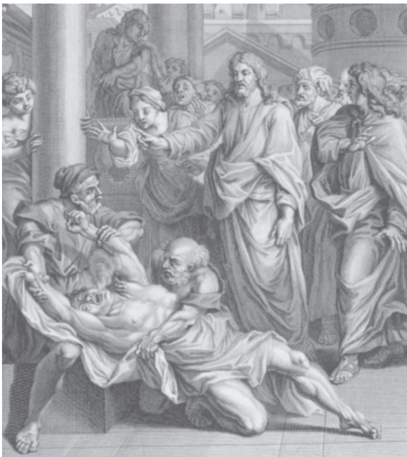
Jesus teaching in the synagogue and healing a demon-possessed man.