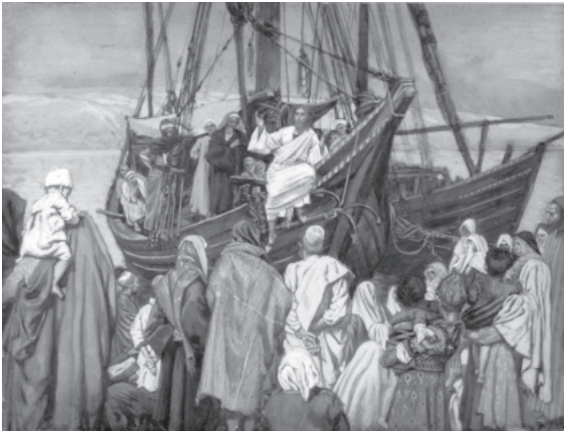
Jesus teaching from the boat with the multitudes on the shore.

We can imagine the people on the beach looking at each other with puzzled expressions, or maybe muttering to each other: “Is that all? Why is He telling us this? We already know how it works when you plant grain in a field.” Even Jesus’ disciples were wondering what was happening.