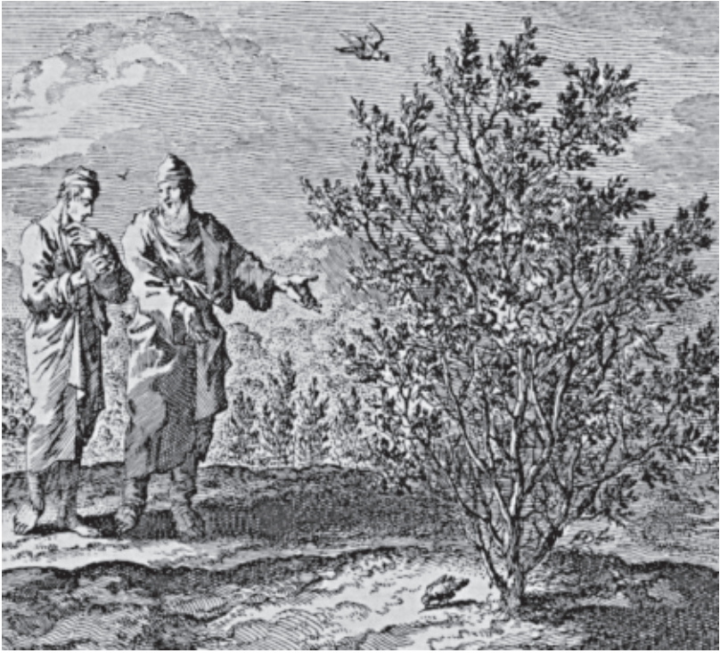
The full-grown mustard tree at the time of the harvest.

even 15 feet tall, with a main stem as thick as a man's arm. Although they are only annual plants, their stems and branches in autumn become hard and rigid and of quite sufficient strength to bear the weight of small birds that are attracted by the edible seeds. ... It is perhaps worthy of note that the seeds of Brassica are small, and were probably the smallest seeds known to the common country folk comprising Jesus' audience in Galilee. ... Brassica nigra did become one of the largest annual herbs in the region. ... Some commentators are of the opinion that the passage implies that birds built their nests in the branches of the mustard. The Greek word employed has no such connotation; it merely means "to settle or rest upon." ... Nor is it justified to suppose that the expression "fowls of the air" denotes large and heavy chicken-like or hawk-like birds. It seems most probable that the word was used to denote the common insectorial (perching) birds of the region, like linnets and finches. Small sparrow-like birds perched on the branches of the mature mus-