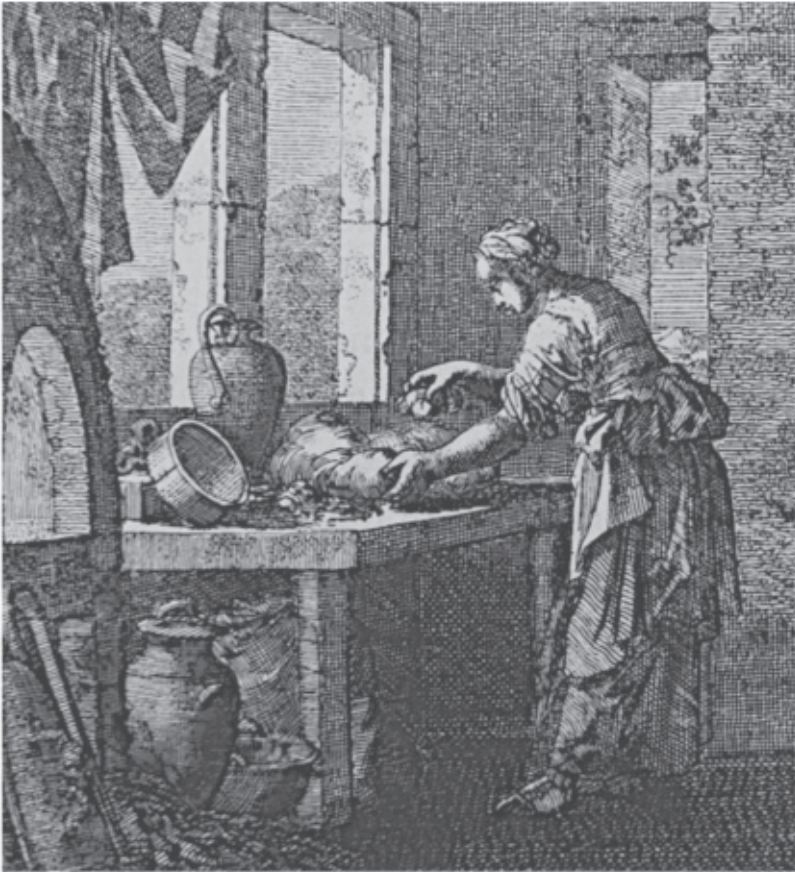
A woman mixing leaven with the dough.

use of this word may not indicate anything beyond the normal process of mixing leaven into a large batch of dough.