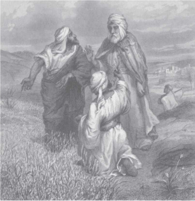
The discovery of the tares among the wheat.