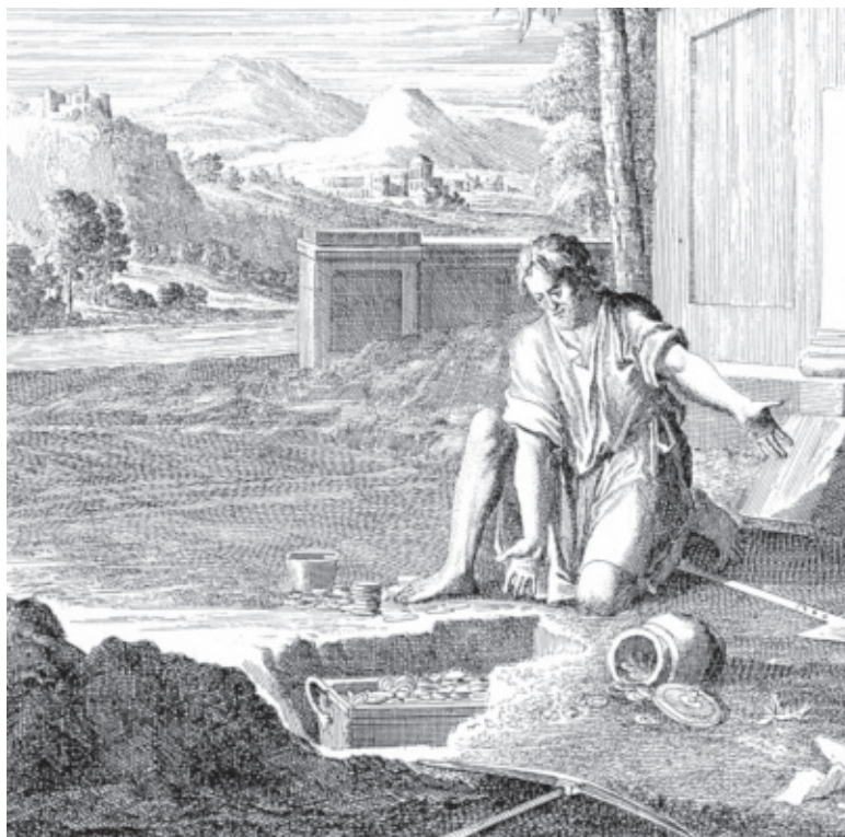
Finding the treasure hidden in the field.

(NIV). This uses the Hebrew word segûllâh which means “special possession, jewel, or treasure.” We see this word again in Deut 26:18 where we read, “The LORD has today declared you to be His people, a treasured possession, as He promised you, and that you should keep all His commandments.” The same Hebrew word is used in these six verses where God was speaking of Israel as His treasured possession: Exod 19:5; Deut 7:6; 14:2; 26:18; Ps 135:4; and Mal 3:17. This identification of Israel as the treasure seems to be the most plausible explanation for the subject of this parable. But if the treasure is God’s people Israel, then why would they be described as hidden? And why, once the man found them, would they be hidden again? One commentator explained it this way: