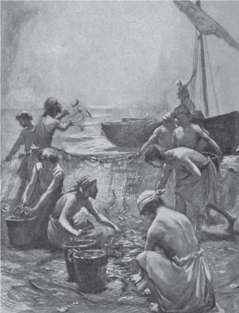
Gathering the good fish into containers - throwing the bad fish away.

Matt 13:49-50 - “So it will be at the end of the age; the angels will come forth and take out the wicked from among the righteous, and will throw them into the furnace of fire; in that place there will be weeping and gnashing of teeth.”